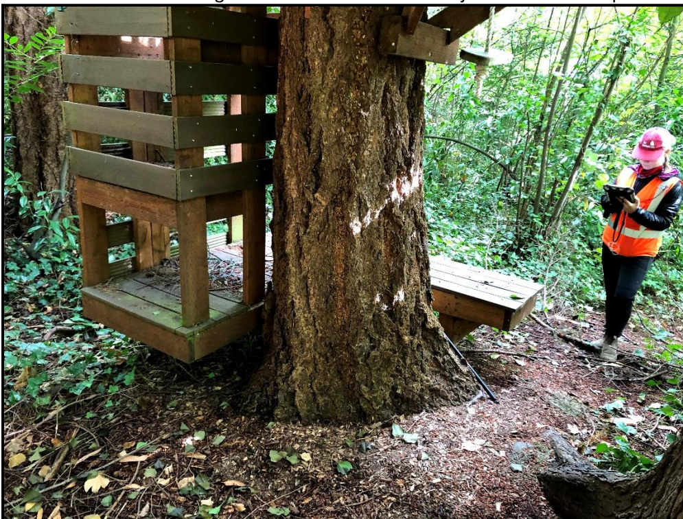
Photo 4. Tree 1810 has a platform and ladder with swing and zipline attachments; it is a primary support for the structures.