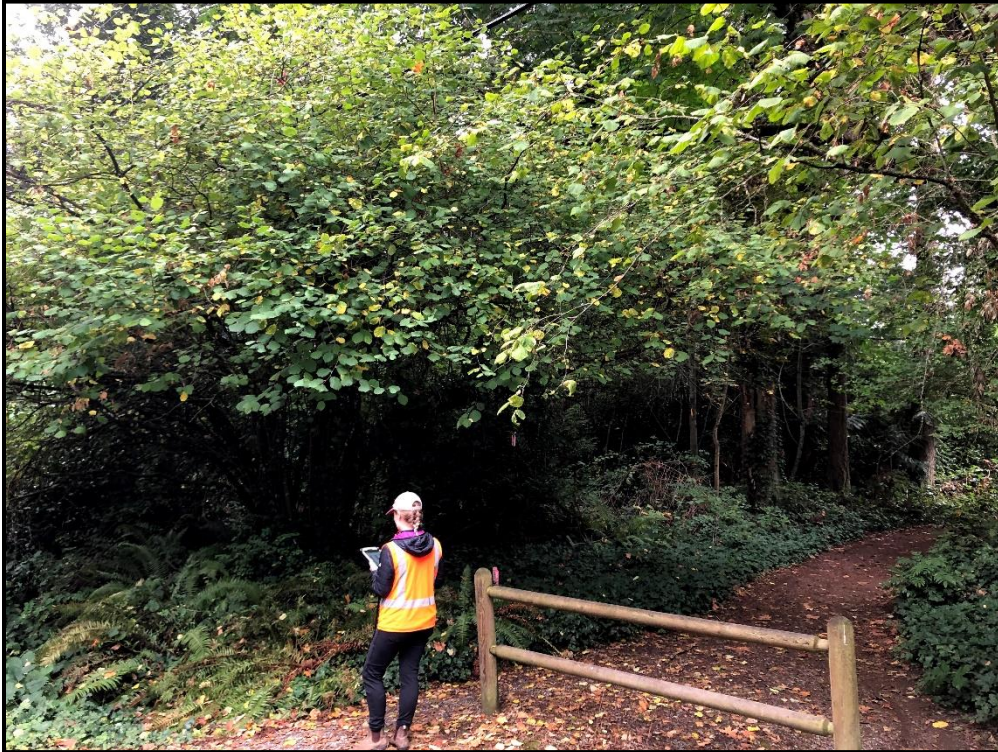
Photo 1. Looking southwest into the site. Walkway on the right is a public path adjacent to the site.