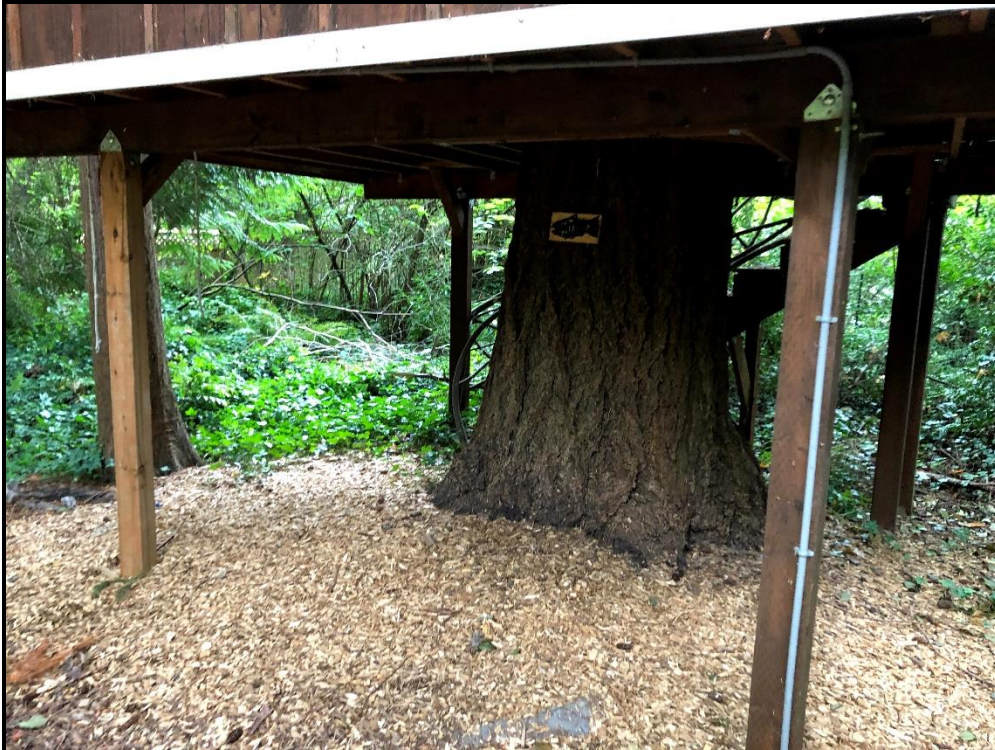
Photo 3. Tree 1806 is not serving as a primary support but is in the center of the treehouse with small attachment hardware. Large diameter surface roots are just below landscape fabric and mulch layer.