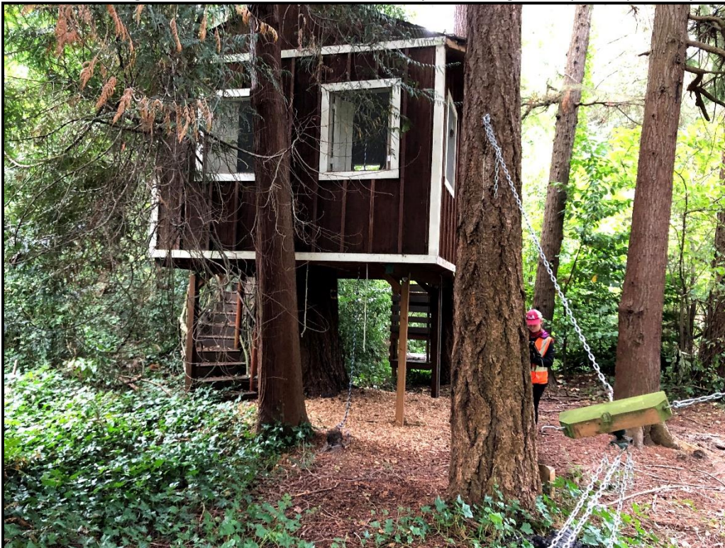
Photo 2. There is a treehouse and associated recreation apparatuses attached to trees near the center of the site.